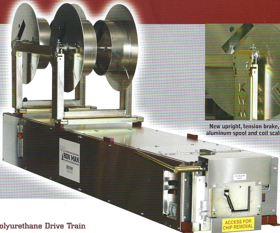
New upright, tension brake, aluminum spool and coil scale